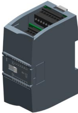
SIMATIC S7-1200, Digital input SM 1221, 16 DI, 24 V DC, Sink/Source