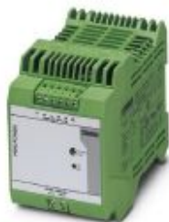
Primary-switched MINI POWER power supply for DIN rail mounting, input: 1-phase, output: 24 V DC/4 A

Please be informed that the data shown in this PDF Document is generated from our Online Catalog. Please find the complete data in the user's documentation. Our General Terms of Use for Downloads are valid ( http://phoenixcontact.com/download )