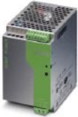
DIN rail power supply unit, primary-switched mode, 1-phase, output: 12 V DC / 10 A

Please be informed that the data shown in this PDF Document is generated from our Online Catalog. Please find the complete data in the user's documentation. Our General Terms of Use for Downloads are valid ( http://phoenixcontact.com/download )