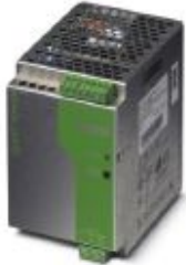
DIN rail power supply unit 24 V DC/10 A, primary switched-mode, 1-phase.

Please be informed that the data shown in this PDF Document is generated from our Online Catalog. Please find the complete data in the user's documentation. Our General Terms of Use for Downloads are valid ( http://phoenixcontact.com/download )