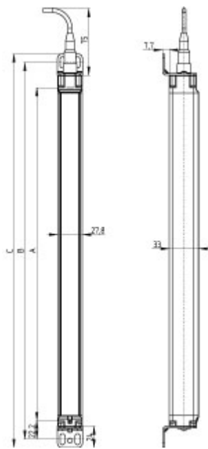
Dimensional drawing (basic component)