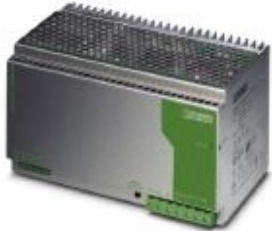
DIN rail power supply unit 24 V DC/40 A, primary switched-mode, 3-phase.

Please be informed that the data shown in this PDF Document is generated from our Online Catalog. Please find the complete data in the user's documentation. Our General Terms of Use for Downloads are valid ( http://phoenixcontact.com/download )